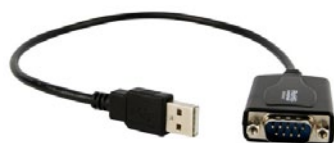
Optional Accessory ID-CBUTN400: USB to Serial (RS-232) Connector.

MatriVideo™ answers the need for larger storage capacity, networkable components, smarter image searching and playback, high image resolution and easier camera relocation. It provides a total solution that meets the emerging and diverse demands of the security industry.