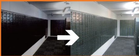
Image Color Enhancing

MatriCam leverages an independent Image Sensor Processor (ISP) to enhance high video qualities in a wide range of lighting environments. The ISP receives the captured image from the sensor and runs it through MatriCam's algorithm to adjust the image's color, contrast, sharpness and brightness parameters automatically for color display optimization in various lighting conditions.